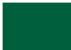
Cool Denali Green