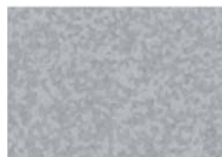
Cool ZINCALUME® Plus